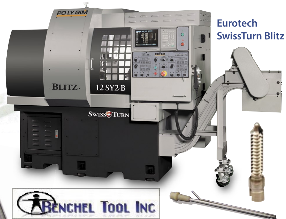
Eurotech SwissTurn Blitz

"With the Eurotech SwissTurn machine, the parts process runs complete and unmanned in just one operation. The accuracy and capability of this machine - not to mention Eurotech's level of service and knowledge about what this machine can accomplish, impressed us a great deal." -- Mike Bellone, Owner of Pioneer