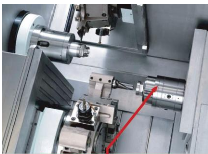
Clear Shift Sub-spindle 192 Cutting Tool Capability

←2) TROFEO - 11 axis bar machine with clear shift sub, five sizes up to 3.15 bar capacity