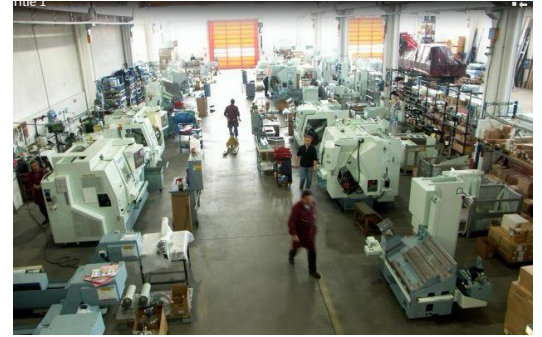
BIGLIA/EUROTCH FACTORY ASSEMBLY FLOOR