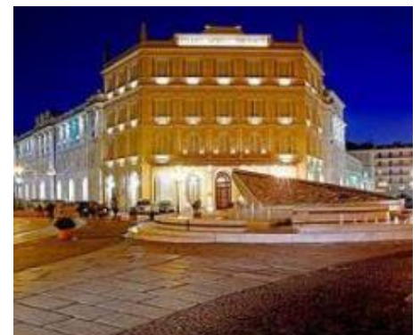
GRAND HOTEL, AQUI TERME