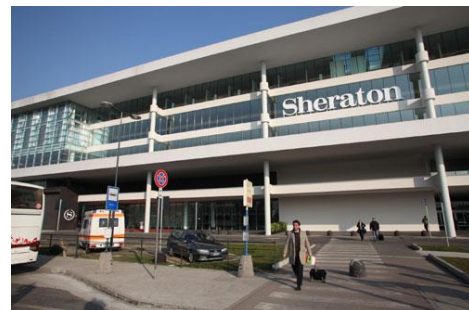
MEET AT EUROTECH COACH – MILAN AIRPORT SHERATON

Wine and hors d'oeuvres at Sky Bar sponsored by MT Marchetti and TOP.