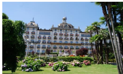
STRESA HOTEL, GRAND BORROMEES