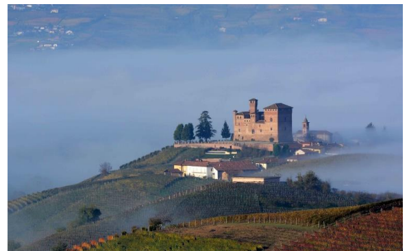
CASTLE GRINZANE WWW.CASTELLOGRINZANE.COM