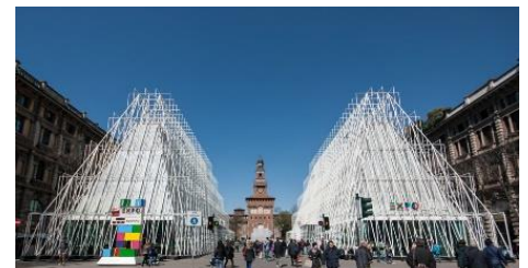
THE WORLD EXPO, MILAN SATURDAY, OCT 10TH

What to expect at the Expo: The Expo is a great place to try the cuisines of many nations around the world. The Expo is a kind of huge open air international restaurant, well, restaurants – there are lots of them! There are 152 pavilions, of which 53 are country pavilions at the Expo and many have eateries featuring national cuisines. Expect to do a lot of walking! The restaurants stay open in the evenings, as do some pavilions.