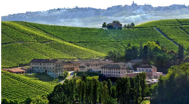
FONTANAFREDDA WINERY, PIEDMONT REGION WWW.FONTANAFREDDA.IT

Tuesday, 13 th -Winery Tour of Fontana Fredda, luncheon & Castle Excursion of Grinzane