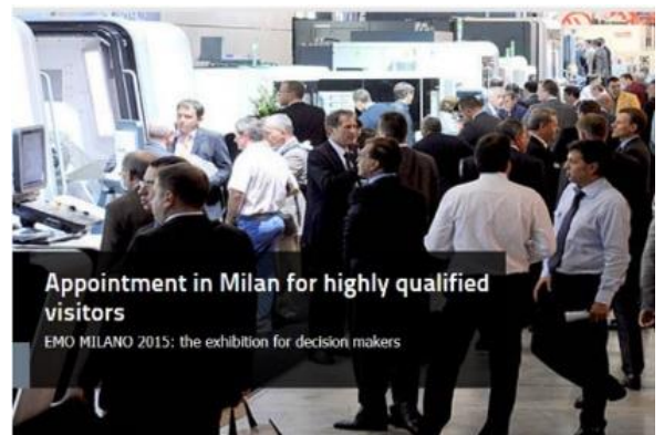
EMO SHOW, FRIDAY OCT 9TH

For your convenience, Coach departs from EMO show front parking lot at 5 PM and will then pick-up at EXPO at 5:20 to return to Grand Hotel. For those who cannot meet coach for departure, simply take taxi back to Grand Hotel Borromees, Stresa.